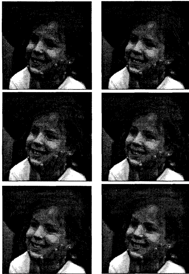
Figure 2. First row: Original and 2 bits/pixel image; Second row: 1 bits/pixel image and 0.5 bits/pixel image Third row: 0.25 bits/pixel image and 0.125 bits/pixel image