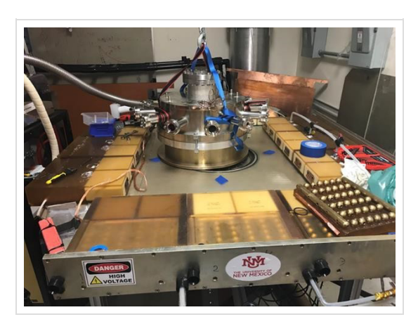
Liner Transformer Driver in the Pulsed Power Test Lab at UNM

The appeal of this project is its broader bonds to others on HPM development